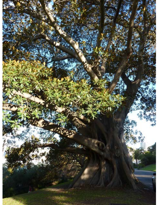
('The Listening tree', Sydney Botanical Gardens)

The sections of this report will discuss support provision for 'missing' families in Australia, share understanding about 'missing' counselling and expand on some themes which may impact people experiencing unresolved loss.