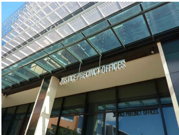
(FFMPU's offices, Parramatta)