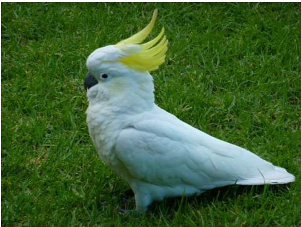
(White Cockatoo, Sydney Botanical Gardens)