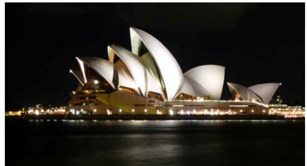
(Sydney Opera House, Sydney Harbour)

This section of the report outlines the aspects of 'missing' service provision that currently exist in Australia.