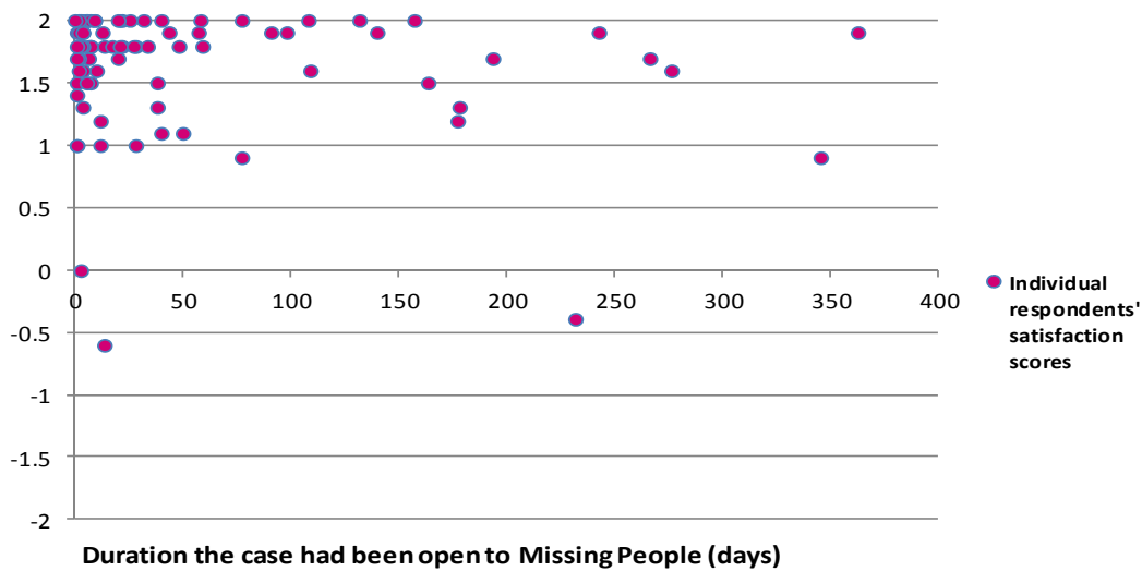
Figure 3: Satisfaction scores by duration for cases where the missing person has been found to have died