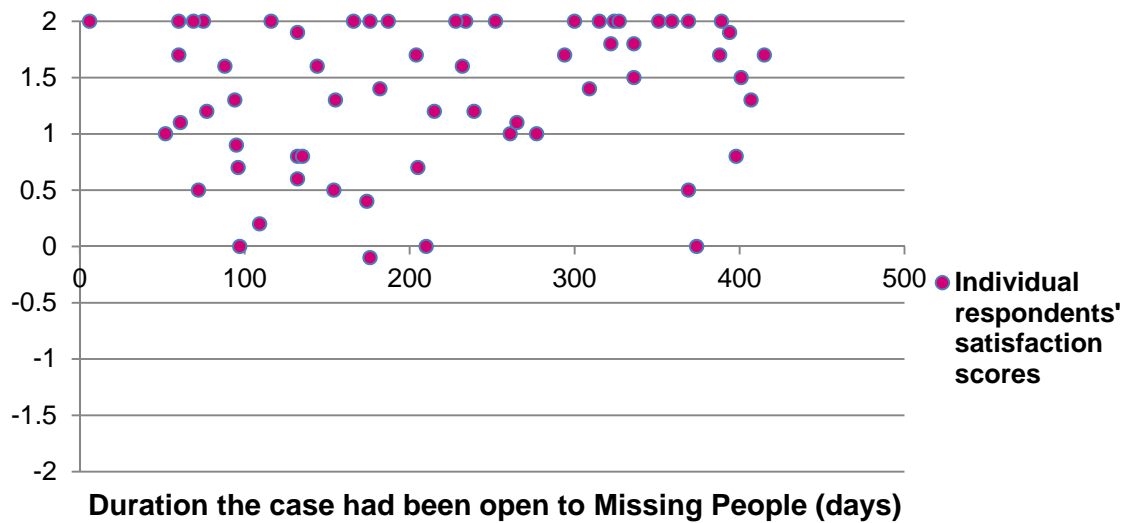
Figure 4: Satisfaction scores by duration for cases where the missing person is still missing

“I was impressed with every aspect of what you do.”